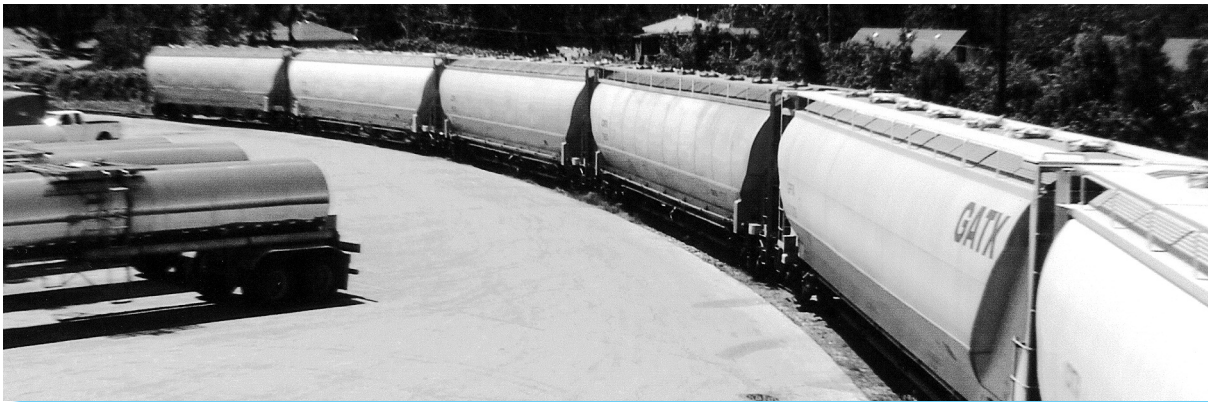
Rail siding at Carry's Bridgeview terminal

Again in conjunction with the IHB, Carry recently has added a second Chicago-area bulk transload location in Argo, near its Bridgeview terminal. The facility features 15 rail car spots, expandable to 100. Most important strategically, Argo is a “multi-rail service” site; the IHB short line connects to all major railroads servicing the Chicago market. Carry is pleased to expand its business relationship with IHB, which is the largest switch carrier in the U.S. Its